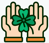
Hand Holding Experience